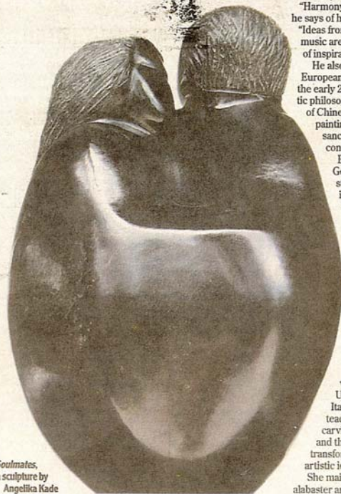
Soulmates , a sculpture by Angelika Kade

To find out more about the expressive figure-drawing workshop, call the Art League of Marco Island at 394-4221 or visit its Web site at www.marcoislandart.com .