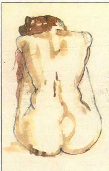
Nude Attitude 13 , a watercolor by Bill Buchman

She mainly works with alabaster and marble, and